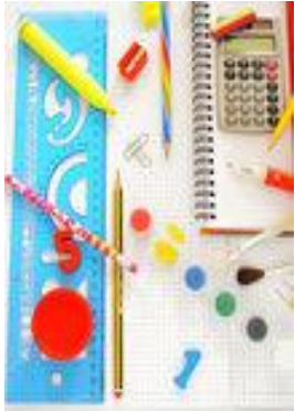
Label supplies with student first and last name